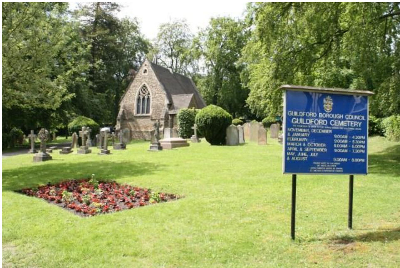
Guildford Cemetery

Guildford Cemetery is on the old Farnham Road. The Guildford War Hospital with 445 beds was established in the Infirmary. There are 33 Commonwealth War Graves in this Cemetery – 13 from World War 1 & 20 from World War 2. There is only 1 Australian War Grave.