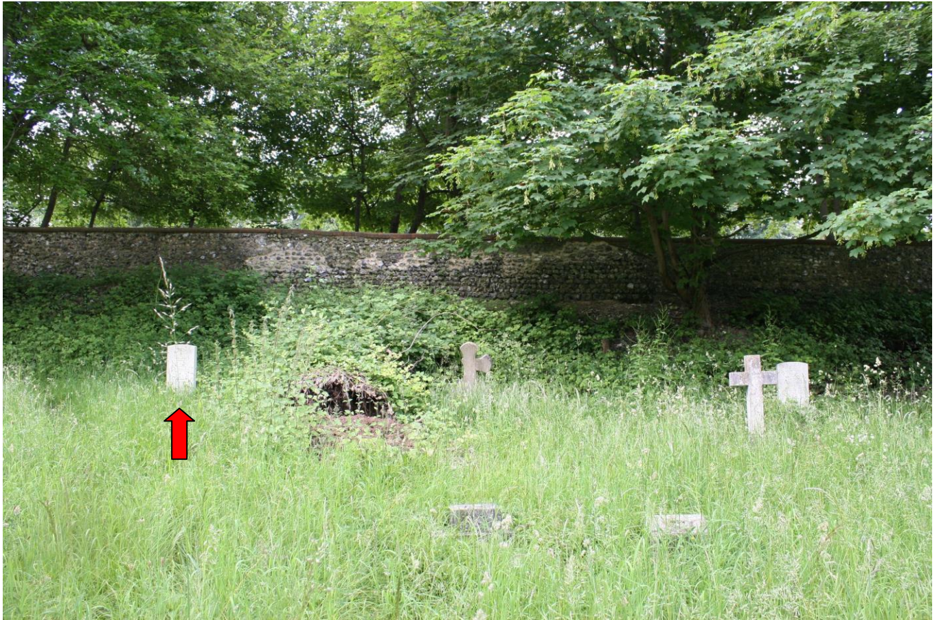
Guildford Cemetery

Pte Frank Maul's headstone marked by red arrow