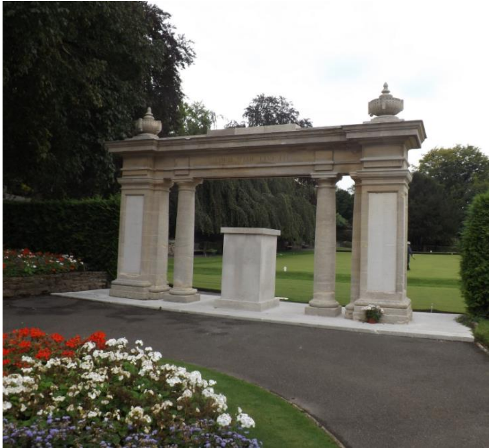
Guildford War Memorial