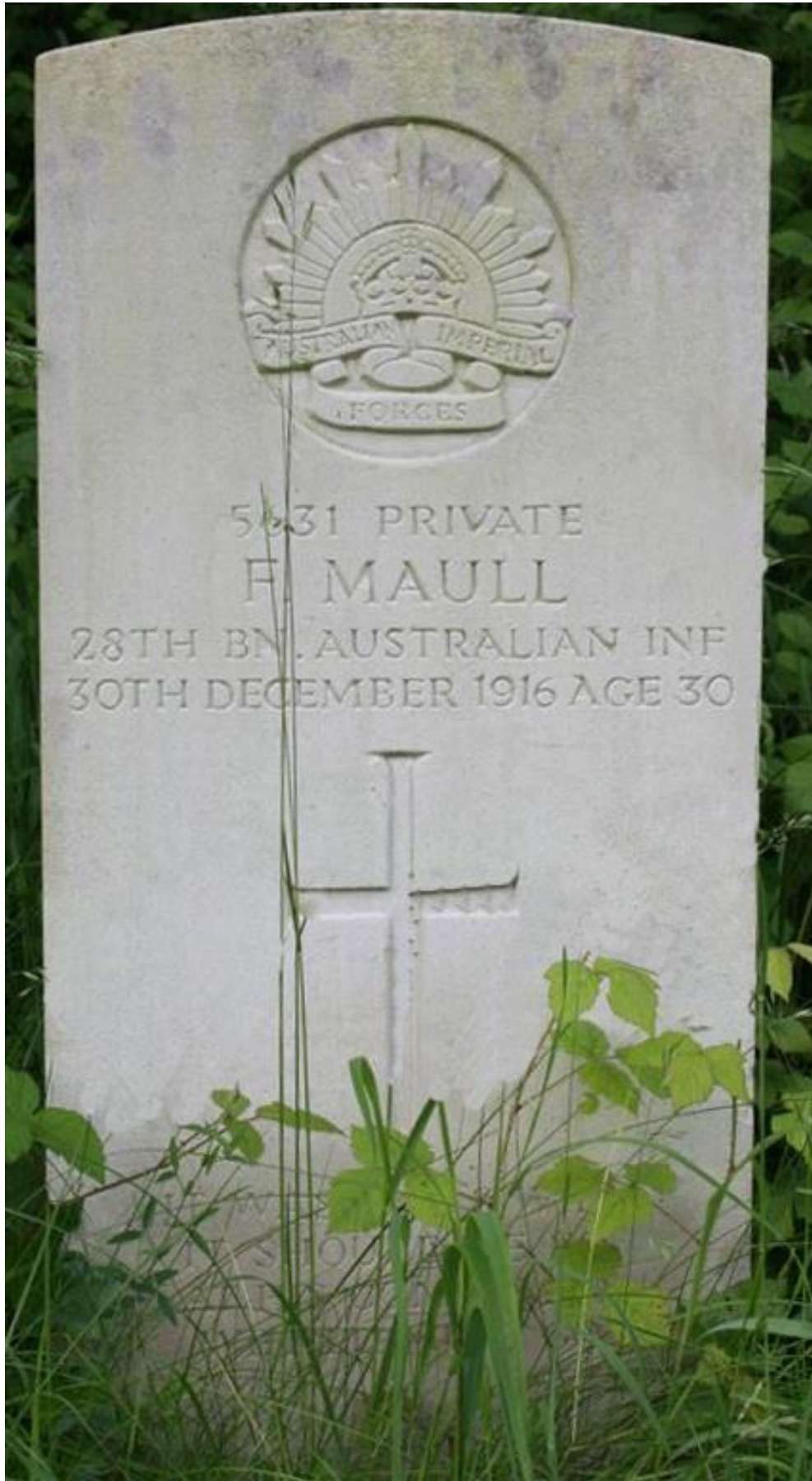
Photo of Private F. Maull's Commonwealth War Graves Commission Headstone in Guildford Cemetery, Guildford, Surrey, England.